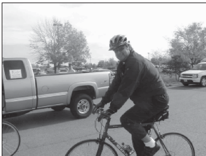
Governor Bill Richardson heads out at the 2005 Santa Fe Century.