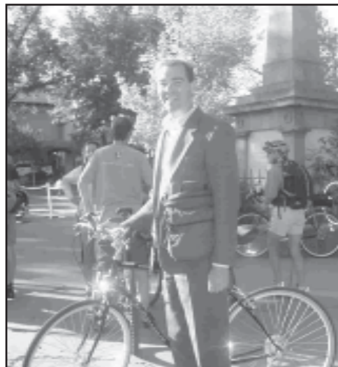
Another suit-and-tie on his way to the office on May 19th.