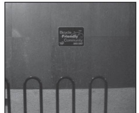
Bicycle Friendly Community plaque outside Albuquerque City Hall

Section 12. The speed limit for bike boulevards shall be 18 miles per hour.