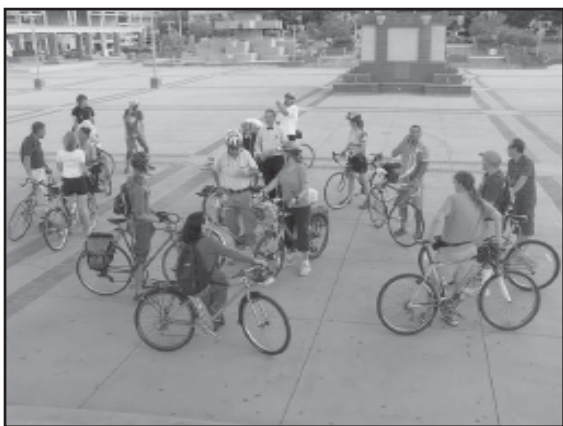
Cyclists converge on Albuquerque's Civic Plaza

At the City Council meeting, several cyclists spoke to the councilors on the importance of a Bike Boulevard. The meeting lasted until almost 11pm as